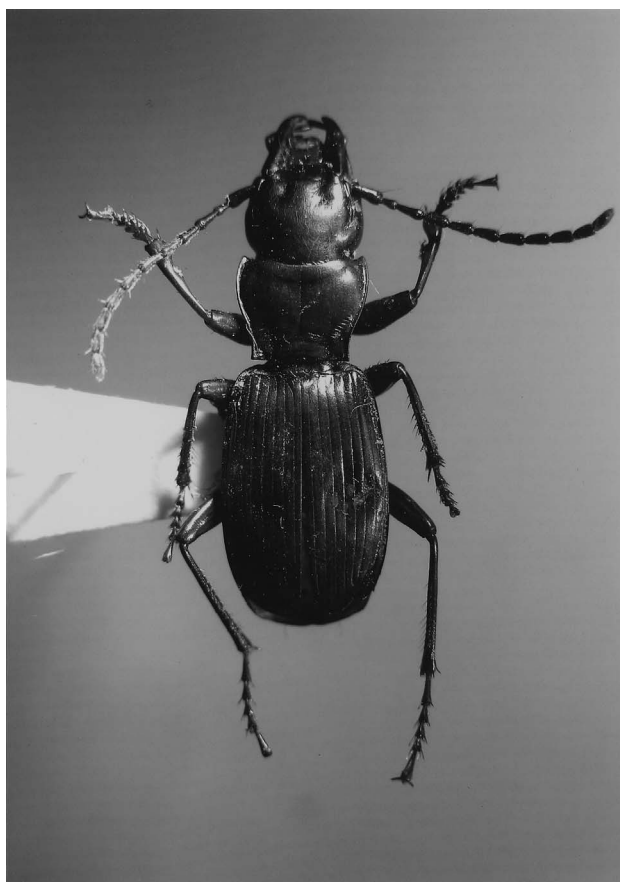
Fig. 1. Pterostichus miyazawai MORITA et OHKAWA, sp. nov., from Shirabiso Pass.

Head very large and convex; eyes vestigial or entirely flat; frontal furrows shallow and divergent posteriad; lateral grooves deep, straight in front, curved inwards and wide at the posterior halves, and then reaching the posterior supraorbital pore on each side; additional groove situated a little outside lateral groove and joining posterior ends of